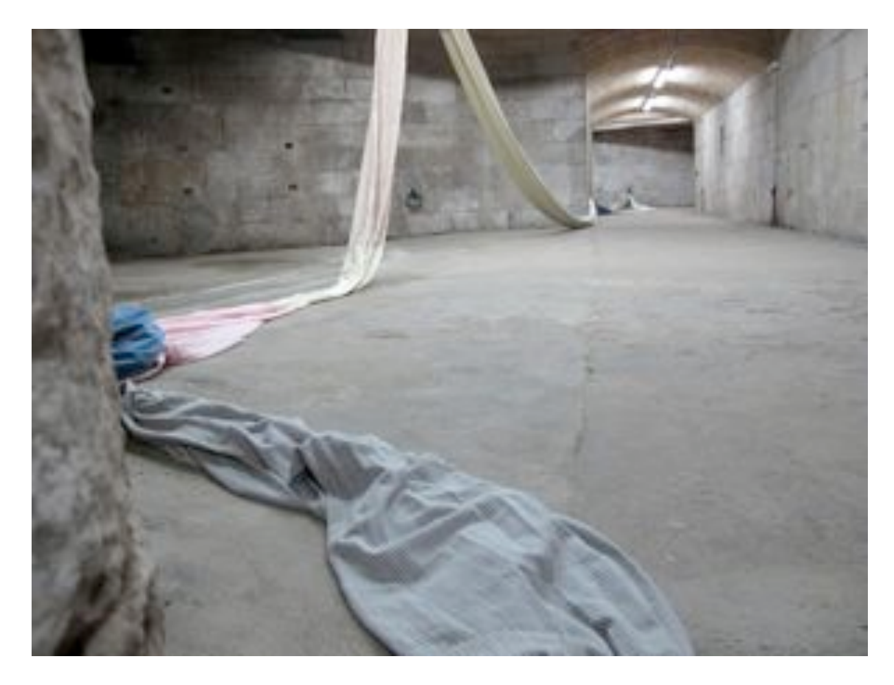
Miki Tallone In A Low Voice , Installation, 2014